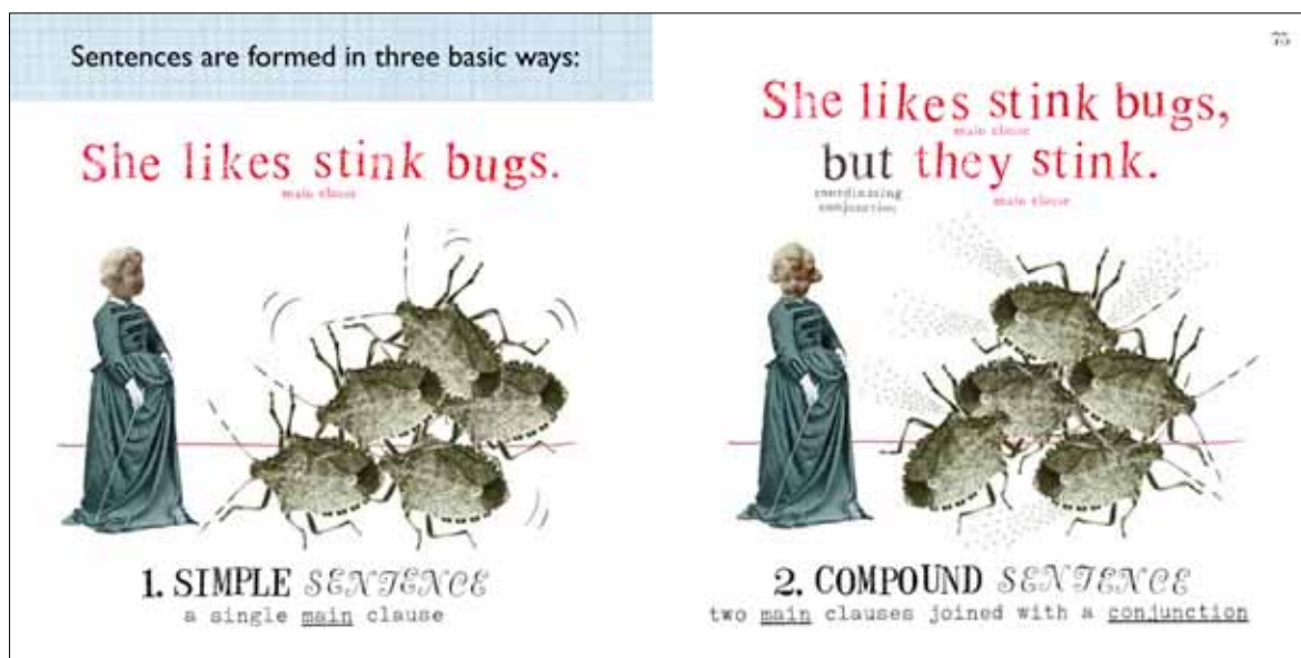
Spread from The Greatest Gatsby: a visual book of grammar , Penguin, 2015

The first opportunity I took to have a stink bug in a book was while working on my visual book of English grammar, The Greatest Gatsby , which was published in 2015. In the section on simple sentences, I gleefully used sentences about stink bugs and got to create three pictures of these funny-awful creatures (note the jets of stink in the second illustration).