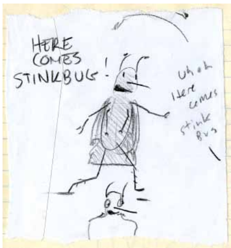
Scribbles from my notebook, 2015

The idea of making a character out of a stink bug had been floating around in my notebooks for many years. First of all, I loved the name stink bug – it’s abrupt, funny and awful, all at once. But a character name is not a story, and it took a while for me to figure out what to do with a character who was a stink bug.