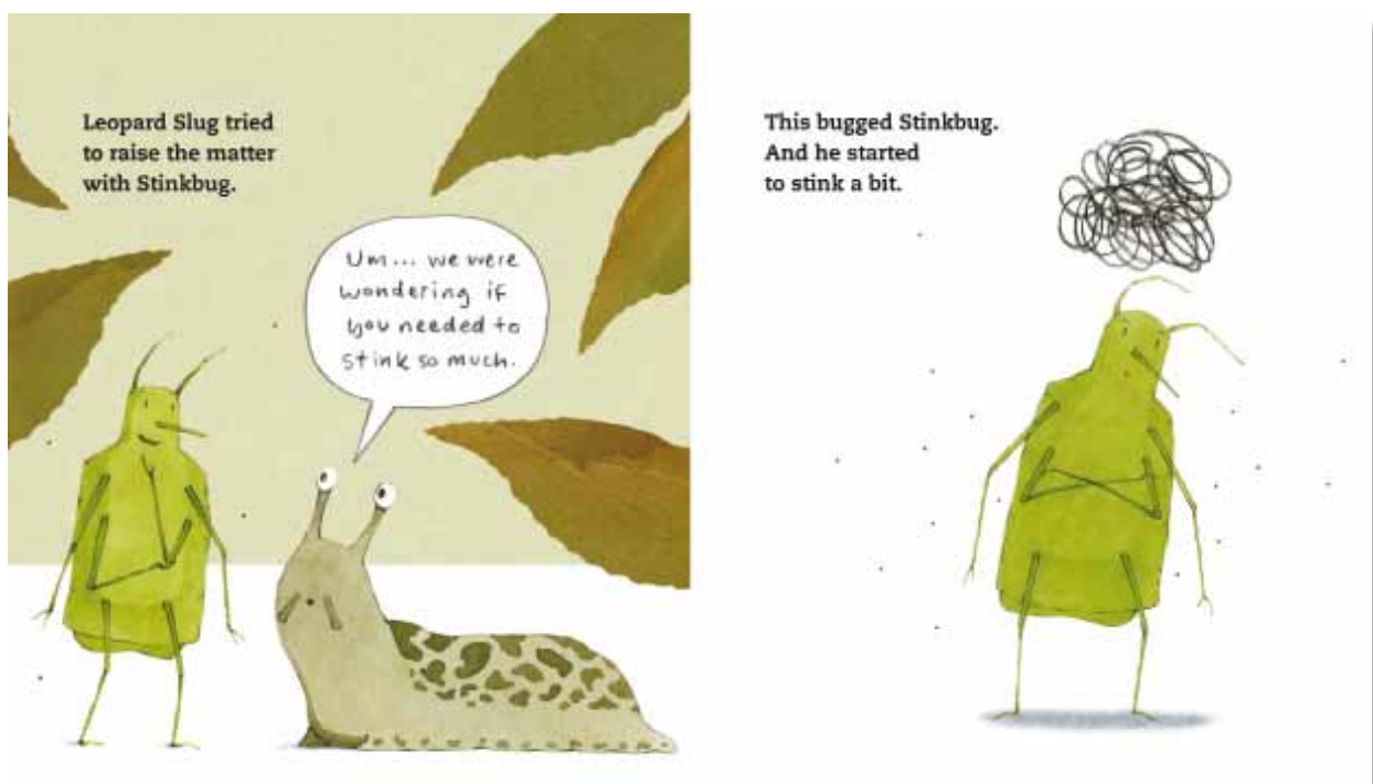
Spread from Here Comes Stinkbug! , Allen & Unwin, 2018

A secondary layer of the text is the direct speech of the characters. I hadn't planned this, but the characters just started saying things – like good characters often do – and it seemed better to show this using the graphic conventions of speech bubbles and thought bubbles, rather than typesetting their speech with repetitive attributions. The intention was that the typeset narrative could stand alone in telling the story, while the handwritten dialogue extended the storytelling.